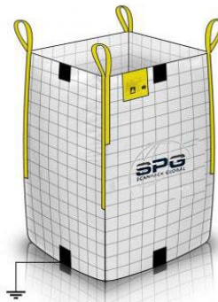
Conductive Bag/Type C

Conductive big bags are used to avoid electrostatic unloading during filling and discharging of the bag. This is necessary when either the product is flammable/explosive or the environment.