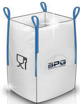
Food Grade Bag

Food grade big bags are intended to come in contact with food. These big bags are produced with special technology to comply with Regulation (EC) 1935/2004 with having BRC certificate.